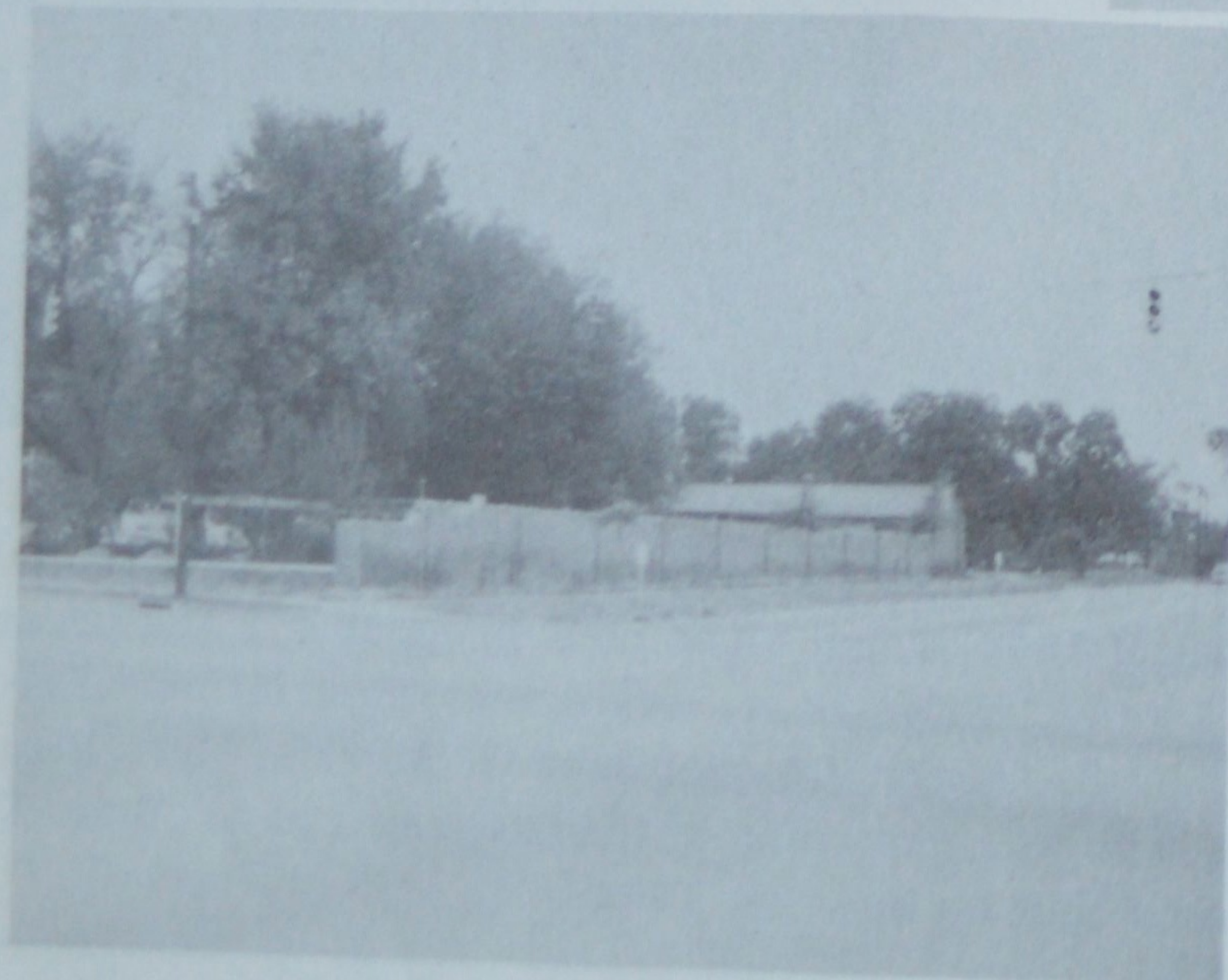
View East down Calhoun Street from Bull Street corner to the smokehouse. Lowering of brick wall still in progress.