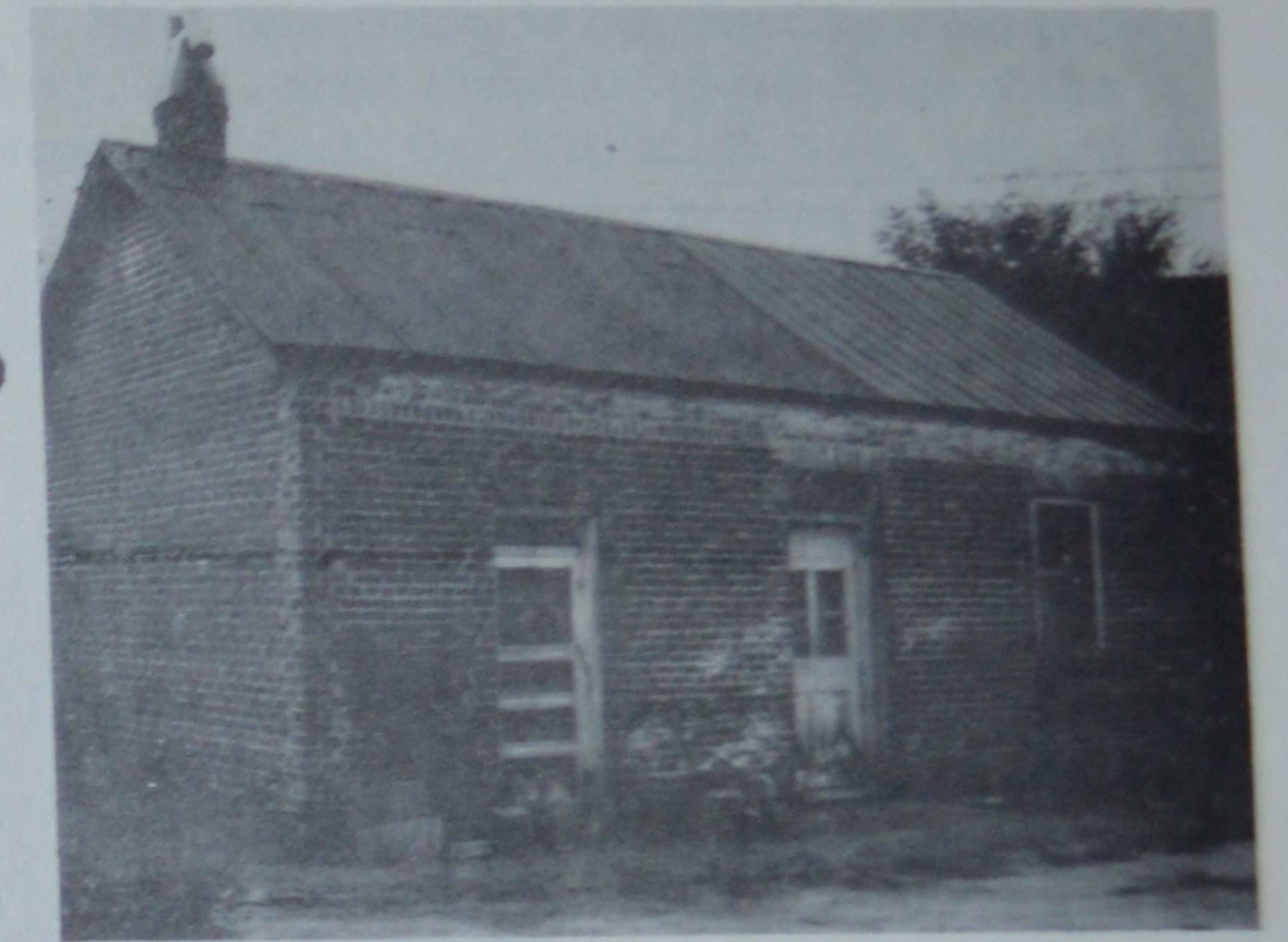
Storeroom, 10 x 14 feet, across drive, East from smokehouse, rear, The Mills Building. Both built in 1830 by Thos. Davis (brickwork) and Thos. H. Wade (woodwork). In recent years storeroom has been storage place for greenhouse and garden materials.