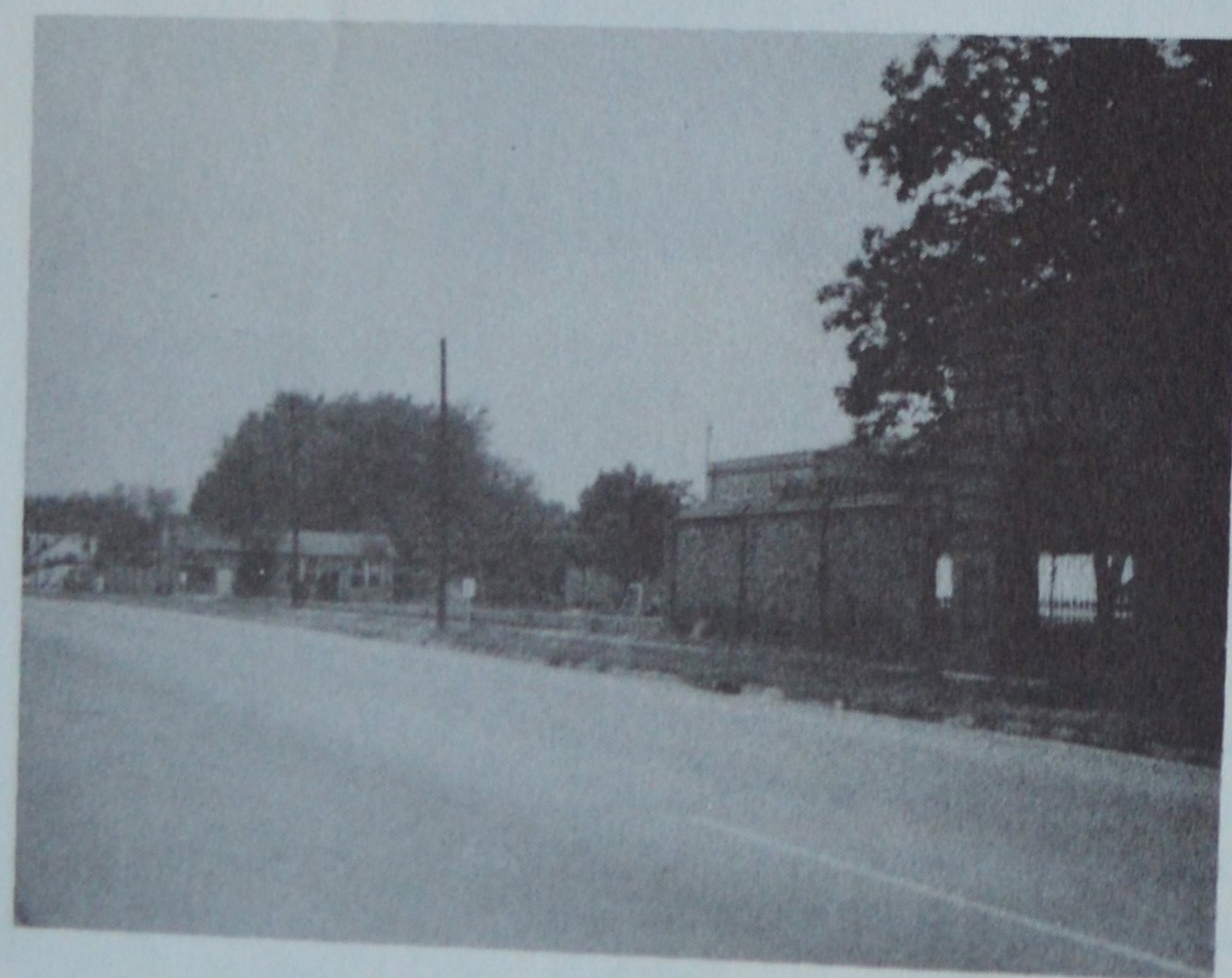
Scene West on Calhoun Street from the 1894 Pickens Street entrance, with view of the 1830 smokehouse.