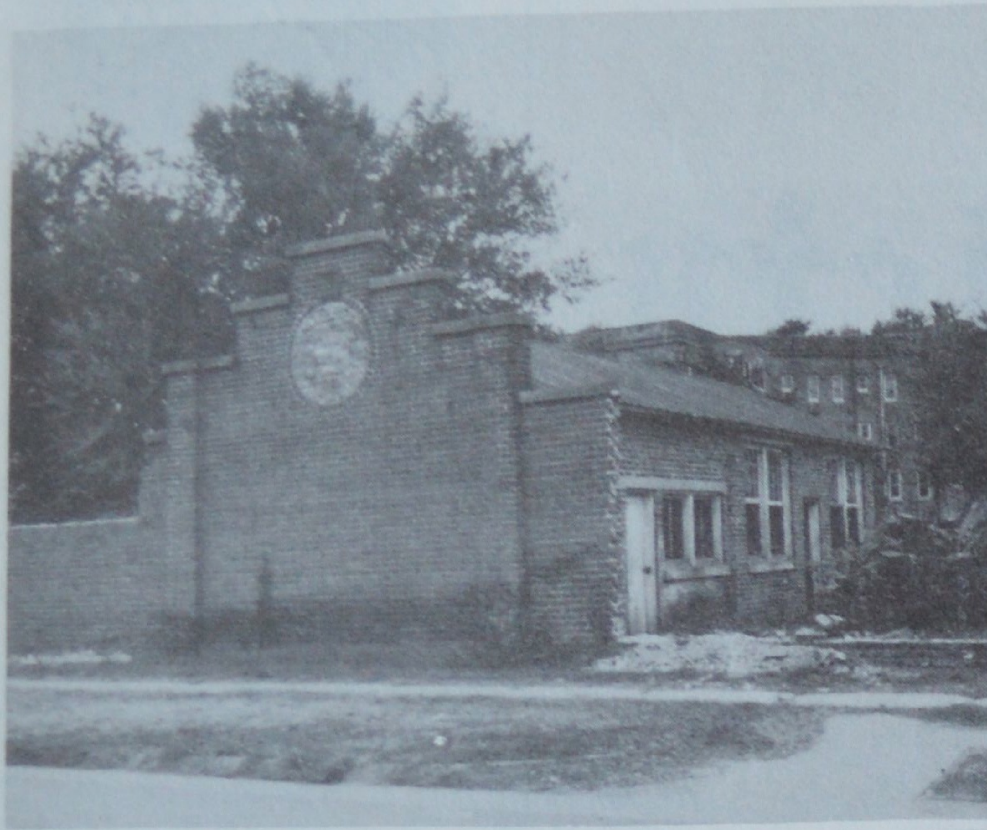
Smokehouse, rear of The Mills Building, built in 1830 by Thos. Davis (brickwork) and Thos. H. Wade (woodwork). The South end is the 1827 massive 12 foot brick wall. Originally 10 x 12 feet, there have been several extensions, and in 1909 the building was used as a stable. Notice ventilator, now bricked in.