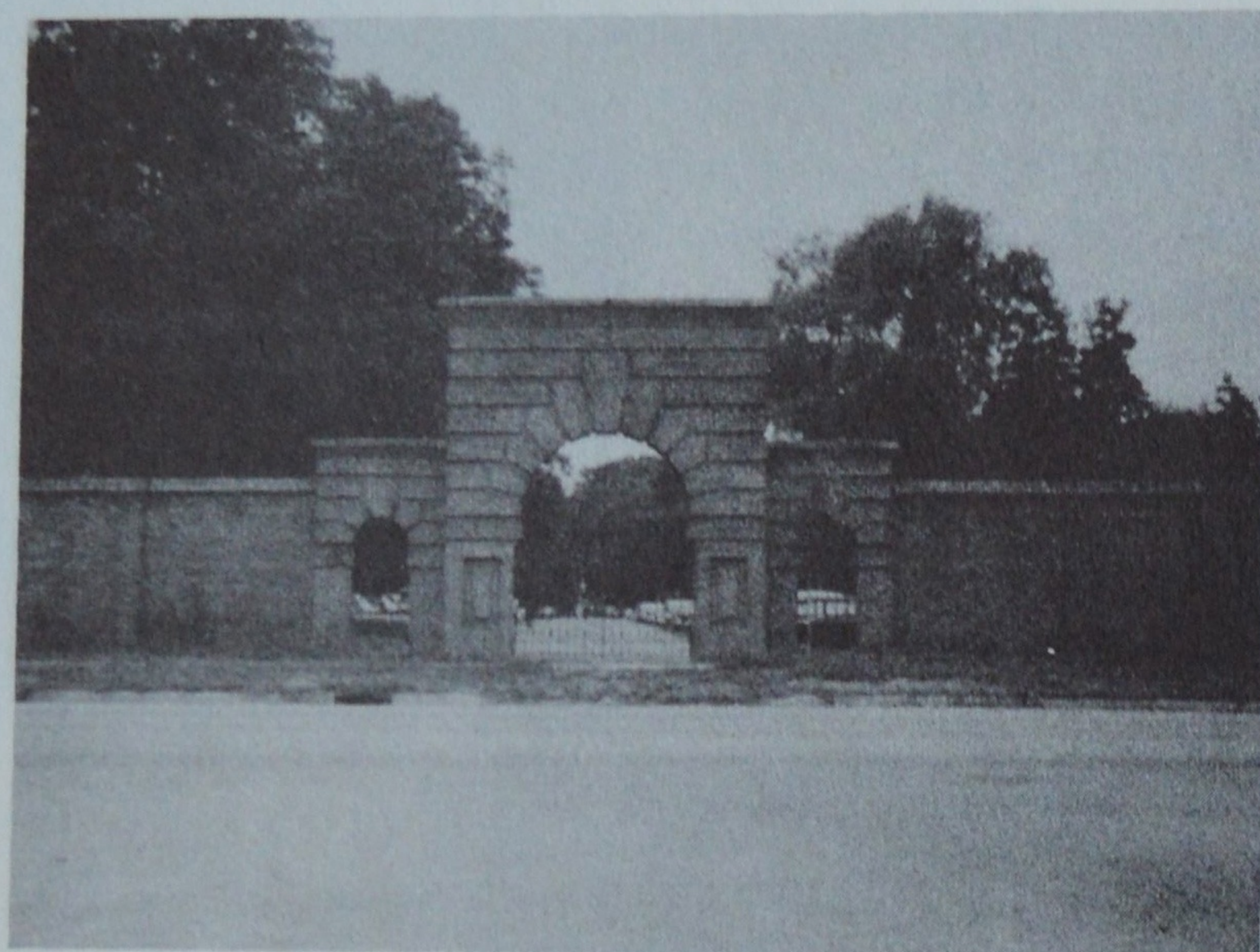
The 1894 Pickens Street iron grillwork gates on Calhoun Street where the lowering of the 12 foot high brick wall will end at this time.