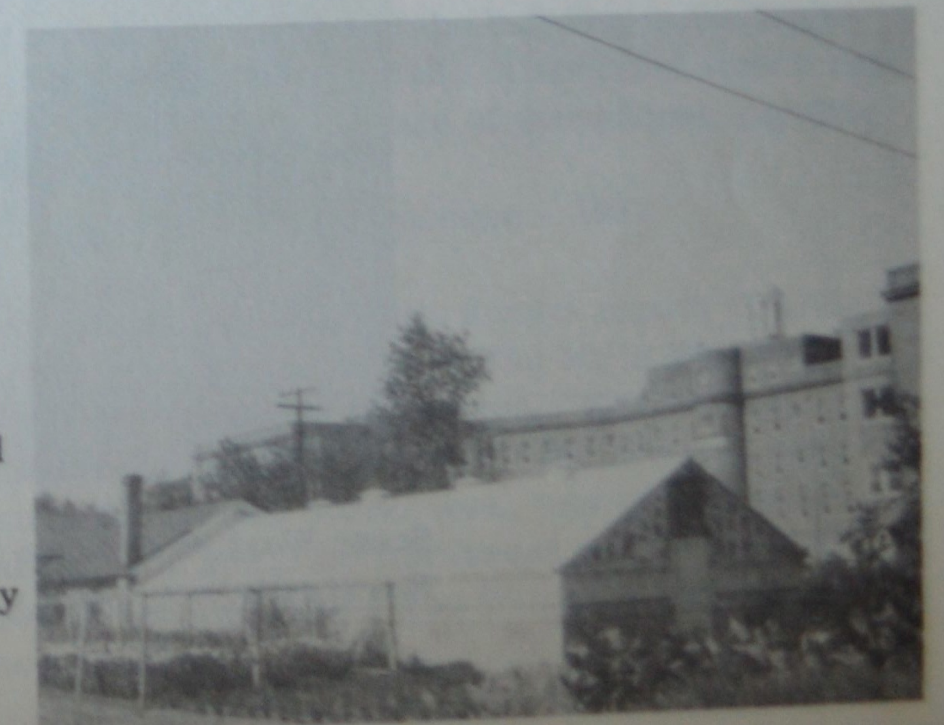
S. C. State Hospital greenhouse 1938 , rear, The Mills Building, across drive to East from 1830 storeroom and smokehouse. For unknown years greenhouse was in front of and to West of present location of The Williams Building. Moved to present site in 1938. Reports indicate a greenhouse in The Mills Building area in 1842, exact location not given. Greenhouse to be moved to far Southeastern area, Columbia Unit, toward Southern railroad when present lowering of 12 foot 1827 brick wall partially surrounding hospital is completed, 1963.