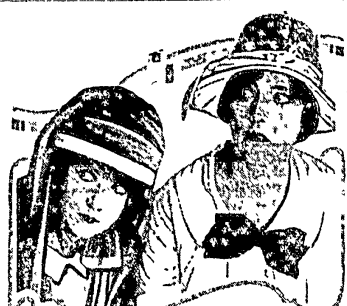
MARGUERITE CLARK, "Widow By Proxy"