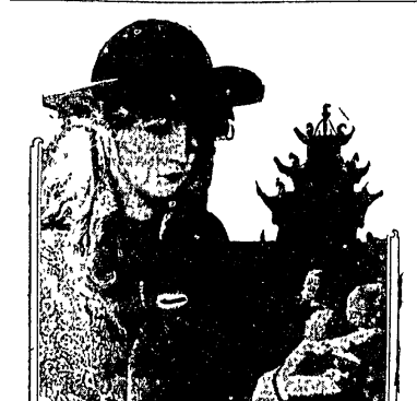
LILLIAN GISH "THE GIRL IN D.W. GRIFFITH'S 'BROKEN BLOSSOMS'"

AT THE RIVOLI FOUR DAYS COMMENCING TOMORROW.