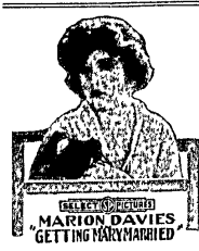
MARION DAVIES in "GETTING HARMONIZED" at the Rialto Theater.