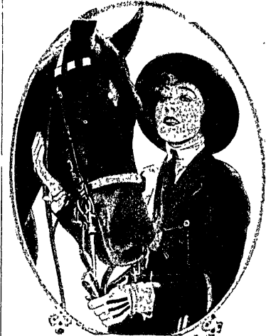
ETHEL CLAYTON in "VICKY VAN" at the Ideal Theater.