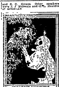
CLARA KIMBALL YOUNG in "THE ROAD THROUGH THE DARK" at the Rialto Theater.

Clara Kimball Young in "The Road Through the Dark," will be seen at the Rialto Theater Monday. The play is a most successful one and is well received by the audience.